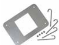
XBA17 nchorage base with clamps. Pc./Pack 1