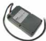
PS224 24 Vdc buffer battery. Pc./Pack 1