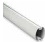
XBA5 White paint-finished aluminium bar 69x92x5150 mm. Pc./Pack 1