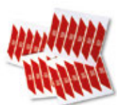
WA10 Red adhesive reflector strips. Pc./Pack 24