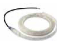
XBA18 Indicator lights for click fixture on upper or lower side of bar. Length 8 m. Pc./Pack 1