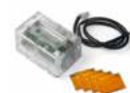
XBA7 Integrable flashing light. Pc./Pack 1