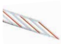
WA13 Aluminium rack up to 2 m. Pc./Pack 1