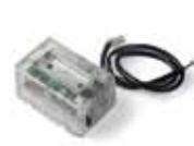
XBA8 Integrable traffic light. Pc./Pack 1