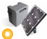
SOLEMYO KIT The solar power to automate gates, garage doors or barrier gates.