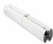
XBA9 Expansion joint. Pc./Pack 1