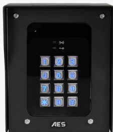
KEY-AUX-PBK-EU Aux pedestal unit with keypad.