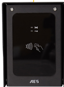
Gate/Entrance 3 Auxiliary Prox Unit