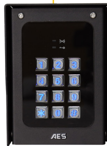
Gate/Entrance 4 Auxiliary Prox & Keypad Unit