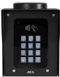
KEY-MST-PBPK-EU Master unit with keypad & prox reader.