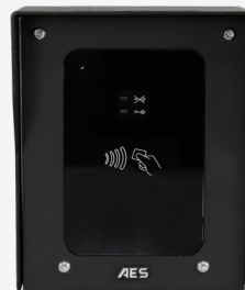
KEY-AUX-PBP-EU Aux pedestal unit with prox reader.