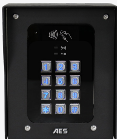
KEY-AUX-PBPK-EU Aux pedestal unit with keypad & prox reader.