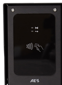
KEY-AUX-IBP-EU Aux unit with prox reader.