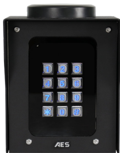
KEY-MST-PBK-EU Master unit with keypad.