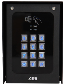
Gate/Entrance 2 Auxiliary Keypad Unit

Standalone GSM/4G keypad system. A great solution for security by covering those extra entrances/gates/doors.