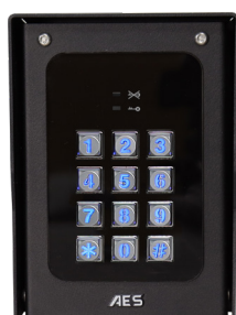
KEY-AUX-IBK-EU Aux unit with keypad.