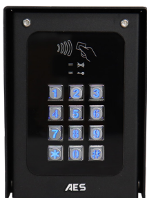
KEY-AUX-IBPK-EU Aux unit with keypad & prox reader.