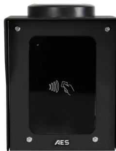
KEY-MST-PBP-EU Master unit with prox reader.